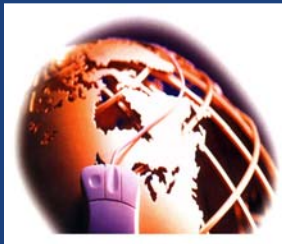
High-Speed Internet or Data