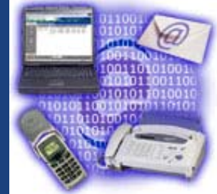
Advanced Voice Messaging